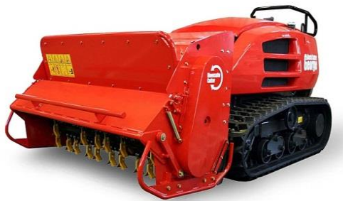
Stand on heavy duty flail mower