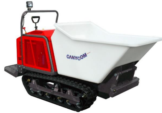
Stand on concrete carrier