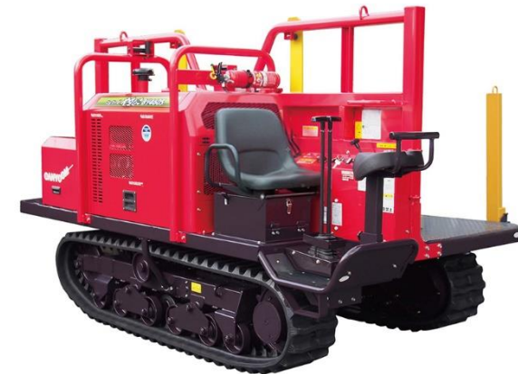
Tracked timber carrier