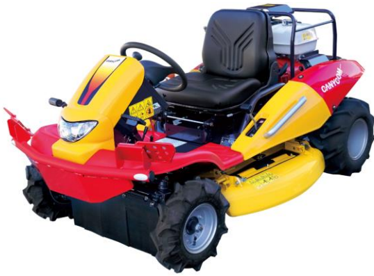
Ride on brush cutters